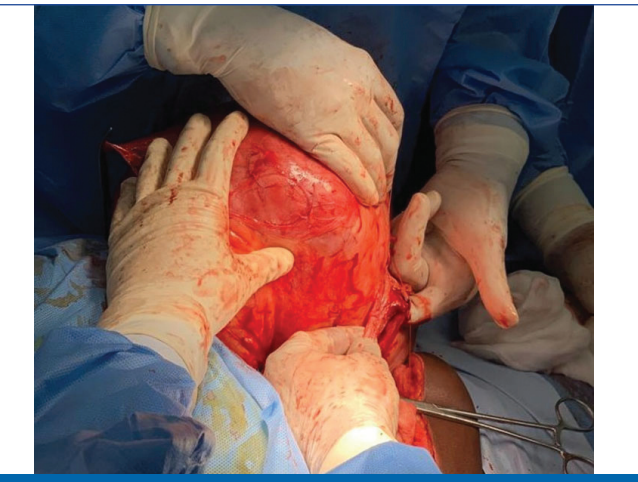
[Table/Fig-3]: Intraoperative image showing a large mass from retroperitoneal origin with extensive peritoneum stretching. No vascular or adjacent structures were found adherent to the mass.

disease was given due to its incidental diagnosis and treatment is primarily surgical for unicentric disease.